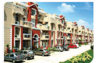
Eldeco Green Meadows Greater Noida