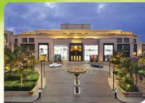
DLF Emporio New Delhi