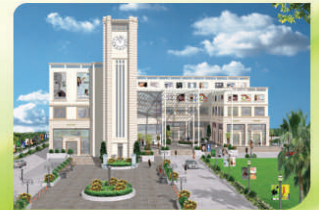
Ivory Tower Mall New Delhi