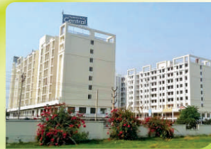
Neemrana Central Rajasthan