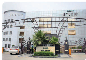
Eldeco Studio Noida