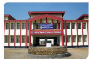
Kendriya Vidhyalaya Assam