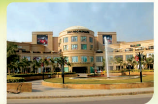
DLF Promenade New Delhi