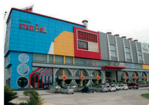
Eldeco Station Faridabad